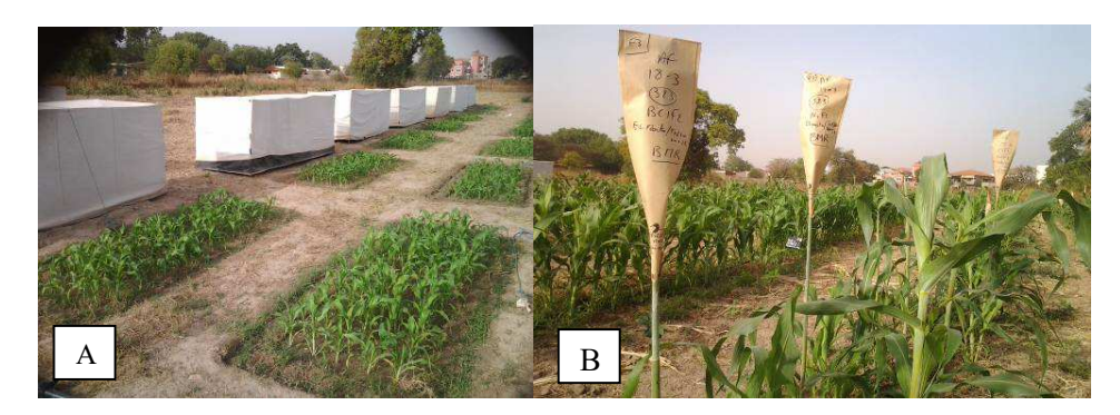
Photo 2: shows the cage technique (A) and breeding population selfing (B) for generation advancement

At harvest, each bmr BC1F2 panicle and F3 panicles was threshed separately. Seeds were pre-germinated in petri-dish first, then transferred in pots after the appearance of their primary root and finally transplanted in the field in late January to early February. Photoperiod sensitive sorghum cultivation in long days (starting March) delays flowering until September avoiding harvest in May or early June. To speed up panicle initiation, seedlings after 21 days of transplantation in open field, were covered (Photo 2 A) with cages every day from 5PM to 8AM, during 30 days. This artificial shortening of day length induces reproductive phase and seed for day length sensitive plants. There is a black plastic layer under each white cotton tissue for firm shade to cover each sorghum plot. All panicles were selfed during all generation advancement. BC1F2 and F3 populations were harvested for adaptation, grain yield and stover potential under rain-fed conditions in Niger in 2017 cropping season.