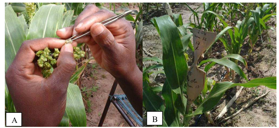
Photo 2: crossing of bmr donor lines to El Mota RP (A) and to Sepon82 (B). The bottom panicle bagged (B) is used to produce recurrent parent seed and the top is to produce F1, Sotuba, 2016 offseason.

At flowering stage, RPs were hand emasculated using tweezers/forceps (Photo 2 A). The hand emasculation technique using tweezers was chosen to minimize the amount of seedlings from self-fertilization in F1 plants. Fifty to sixty flowers of each RP per cross were chosen for each crossing. Flowers from the top of each panicle were emasculated. Anthers were removed in each female and male flower. Two to three days after emasculation recurrent parents were dusted with donor parent pollen. Flowers from the bottom of the same female panicle were bagged in order to produce identical recurrent parents' seeds (Photo 2 B). Other flowers on the same female plant were completely discarded to avoid seed pollution. Likewise, each donor parent was crossed to each recurrent parent to produce F1 seed for each population. Matured crosses were harvested and kept separately. Donor parent plant seed was also selfed. RP and F1 seeds were threshed independently to avoid any seed mixture and stored at 4°C for the next F2 or BC1 population development.