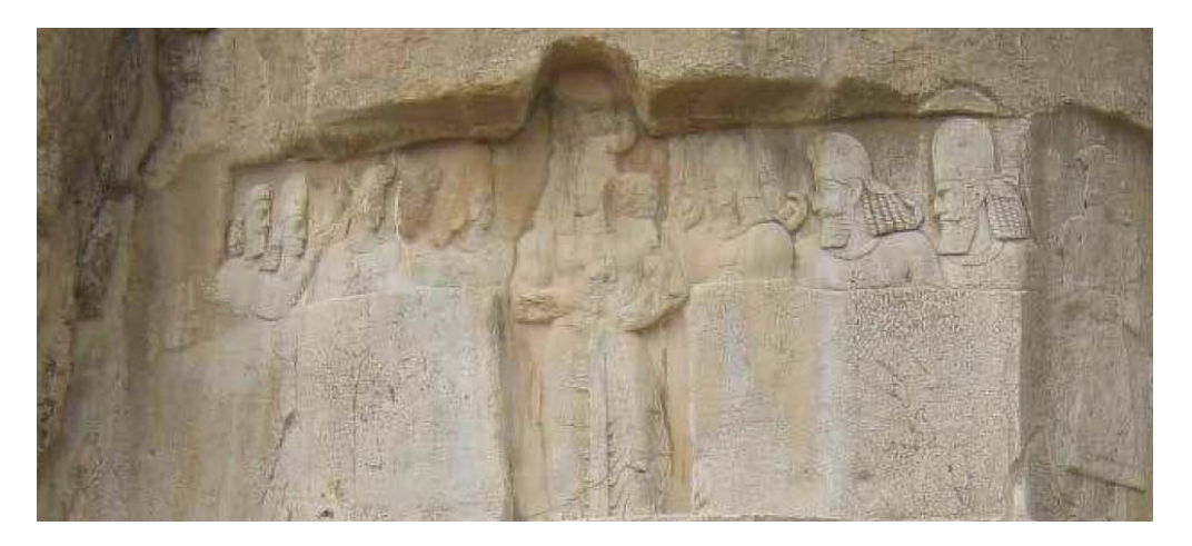
Fig. 2. The figure of Bahram II in the family and elders - Naqsh-e- Rustam. (16)