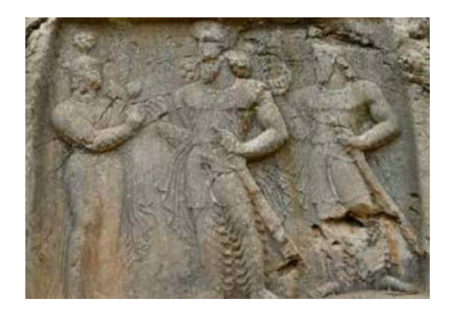
Fig. 3. The figure of Anahita while blessing the Medal of Shapur I – Tang-e- Qandil. (16).