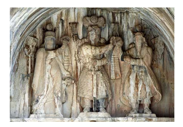
Fig. 1: Anahita and Ahura-Mazda granting crown to Khosrow Parviz in Taq-e Bostan. (16).

430-year Sassanid period. The status of women in Iranian society has declined due to their weak roles in political developments, although it is not assumed that they are irrational. It is evident that the position of women in the Sasanian period is different from previous periods when Anahita, along with Ahura-Mazda, played a crucial role in political developments.