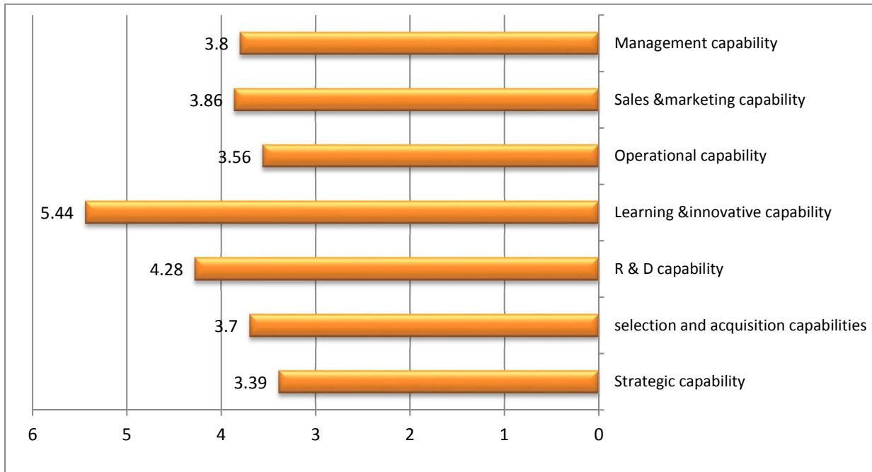
Diagram2: Prioritization of dimensions of technological capabilities