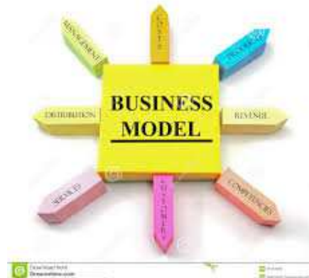
Figure 1: Using an e-business model

In connection with the organization's business model and strategy, there is disagreement among the experts. Group strategy and business model to independent categories known that little Vashan together. Both believe the other to overlap more and the third group strategy and business model are working on a issue. The fourth group's business model and strategy under the fifth group strategy, business model, consider the following set.